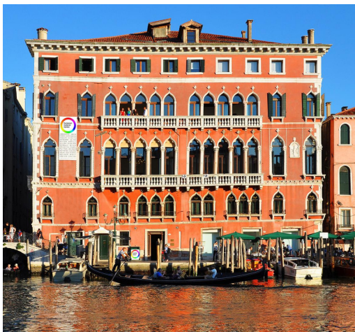
Palazzo Bembo Venice, Italy