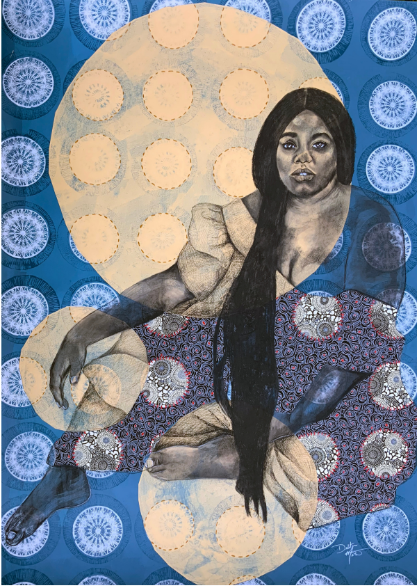
"The Moon Now Rises" Relief Printing, Charcoal, Acrylic, Decorative Papers, Hand Stitching 52 x 72 2020

Collection: St. Lawrence University Richard F. Brush Art Gallery Griffiths Arts Center G1 Canton, NY