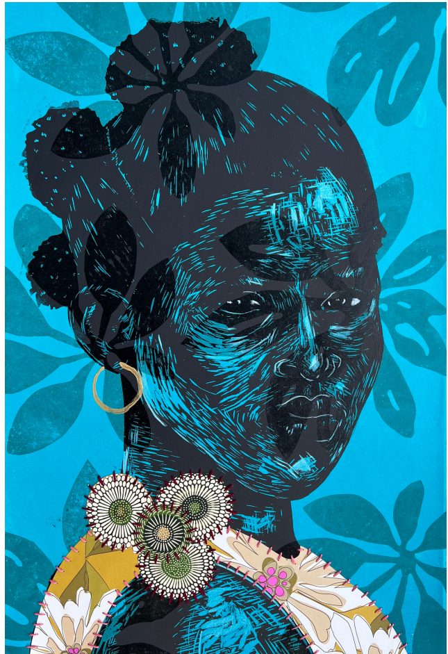
"Flower Of Nightfall: Edition 4 of 6" Relief Printing, Silkscreen, Acrylic, Decorative Paper, Hand Stitching, Colored Pencil 18 x 29 2022

Collection: Purdue University - Purdue Galleries West Lafayette, IN